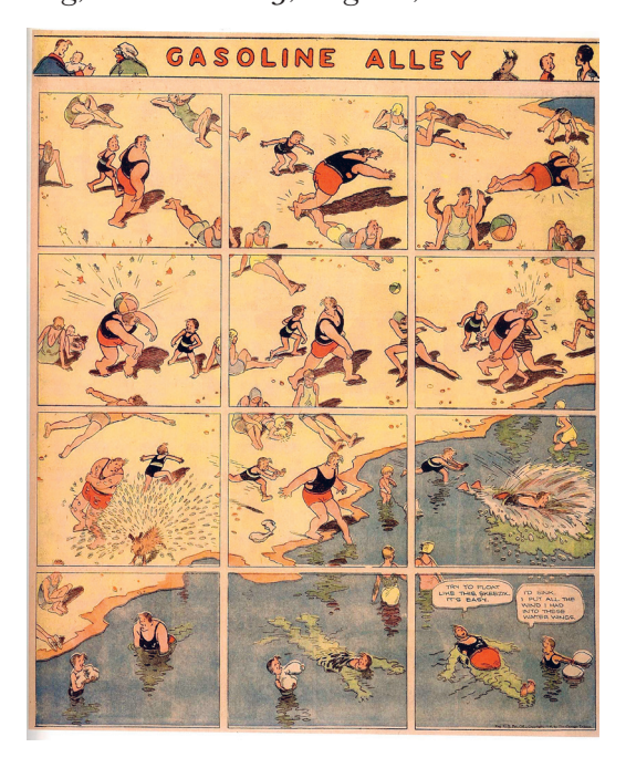
Figure 1 - Frank King, Gasoline Alley, Aug. 24, 1930

So what happens when we take that fact and put it at the heart of what we're doing – as writers and as readers? What happens when we focus on geographical narrative – the construction of a place – rather than temporal narrative – the construction of a series of events? When we replace plot with landscape as the central organising element? And when, instead of going on a journey through time, we set out to create and explore a space?