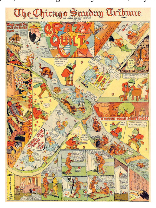
Figure 9 - Crazy Quilt, The Chicago Sunday Tribune, May 3, 1914

There are also many pages dating back to the glorious period of the Sunday Pages that can be taken as further examples. One of the most surprising and complex is the Sunday series Crazy Quilt, published in the Chicago Sunday Tribune from April 12th to June 7th, 1914. The pages of Crazy Quilt (the English term refers to the traditional patchwork typical of North America, composed of parts of fabric of different shapes, materials and colors, recalled in the background in which the title is framed) are presented as a mixture of different comic series, some already appeared on the pages of the magazine, others created for the occasion. The effect is, even for the modern reader, rather unsettling. Not only the sequence of the stripes is forced to co-exist with the simultaneity of the various situations described in the individual series, but also this operation forces the reader's eye to follow paths that are more varied (linear, circular, fragmented, intersecting, etc.), involving him also from the motoric point of view, when he will be forced to rotate the page to better appreciate the plot. We see that even here, in the pages proposed as an example, the visual metaphor of the road or river takes more or less same value that it has in Les trois chemins.