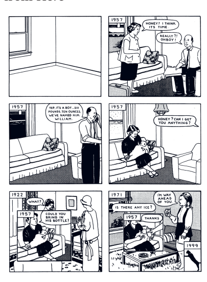
Figure 10 – First page from Here

In the meantime, look at a comic book that is very well known and enormously important for the influence it has had and continues to have on the medium for example on the work of the American cartoonist Chris Ware - as it has radically challenged the concept of comics as sequential art: Here, by Richard McGuire, originally published in the journal Raw, v. 2, n. 1, in 1989. The six pages of Here are structured in a cage with six vignettes (2x3) which in turn contain other vignettes, or inserts, for a total of 85. The six vignettes of the main cage show a fragment of space, an initially unadorned room corner, recounted in a time span from the year 500.957.406.073 BC to year 2033 AD. The narration is not chronologically ordered and the vignettes that open inside the 2x3 cage function like time gashes that show portions of the future or of the past in the same spatial context, marking a contemporaneity of events that fights both against a linear and progressive vision of time, and against the idea of comics as a sequential art. As you may have understood, to explain in words the structure of Here is not only very difficult, but it completely frustrates the particular perceptive and narrative experience offered by this work.