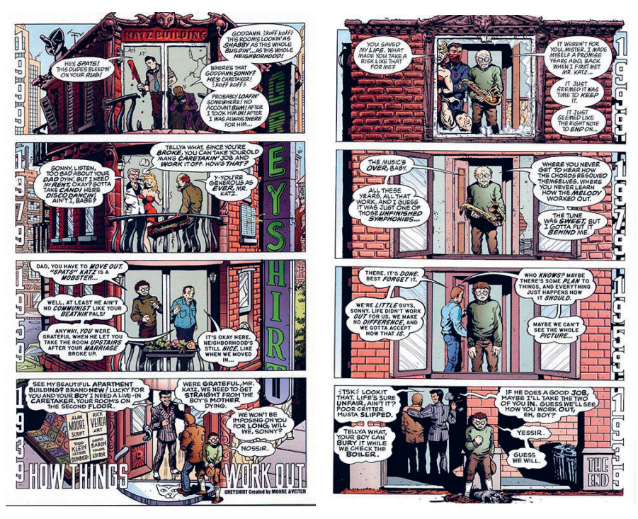
Figure 8 - First and last page from How Thing Works Out

the way impossible – from the cage and the white space, its most original and proper solutions.