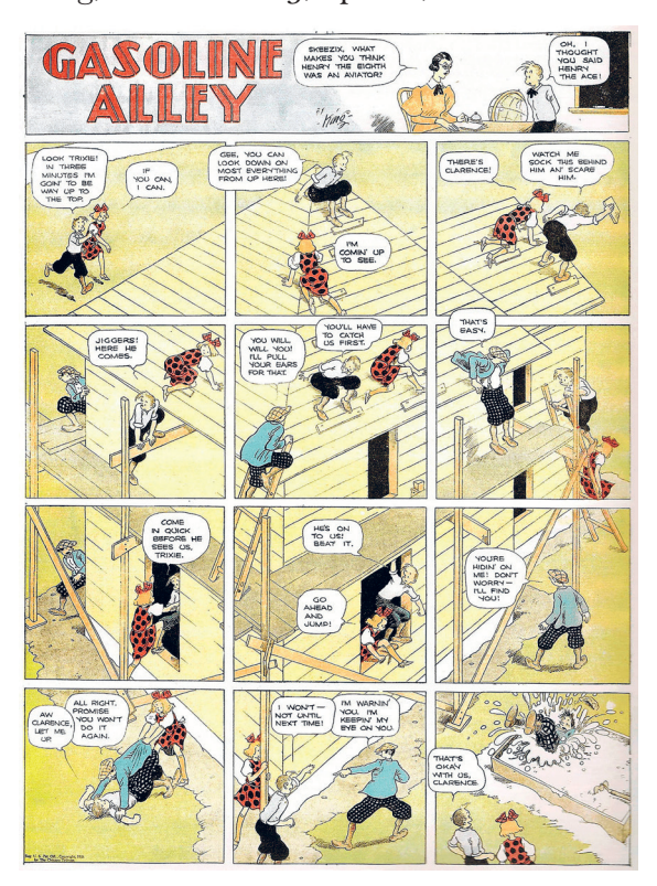
Figure 2 - Frank King, Gasoline Alley, Apr. 22, 1934

To try and answer the previous question, see the two Sunday pages by Gasoline Alley, by Frank King. We are looking at an overall representation that is already sufficient for us to emotionally tune into the narrative space of the comics in question. In particular, by trying to exclude words, the compulsory direction of the sequential reading, intended as the path of the gaze along the usual left--right and low-high directions, will be rather bland and, within certain margins, will be re- or de-constructed by the reader. This impression is strengthened, for example in the marine Sunday strip, by the encroachment of some graphic elements over the edge of the panel. This border acts both as a temporal and a spatial separator, in the case of two moments shown in their contemporaneity as in the case of iconic signs (stars) representing stunning and/or pain in the panels 4 and 6, which encroach on the upper strip, which would conventionally be understood as the past in the narration, they would be traveling back in time. Or you can look at the mini-sequence that consists of panels 5 and 6, in which the bather with the striped bathing suit is initially in front of the protagonist Walt (panel 5) and thereafter (panel 6) she bumps into him while being at the same time behind him.