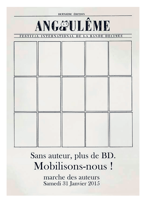
Figure 5 – Syndicat des Auteurs de Bande Dessinée (SNAC BD) manifesto announcing the procession of the authors on the occasion of the 2015 edition of the Angoulême festival

After all, the line is the simplest and most economic form of representation and metaphorization, just as the grid, evident or implied, is the simplest form of organization of the visual material of the comics strip and, at least since the beginning of the twentieth century, the most widespread one, to the point of becoming hegemonic and, at the same time, one of the characteristics automatically and universally associated with the idea that one has of this medium. Line (line) and grid (regular) therefore seem to imply a linear view of the representation of time. We will see that, in the second case, it is not so.