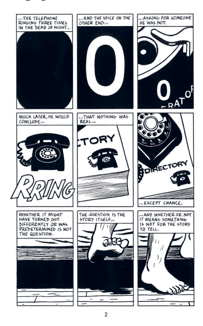
Figure 6 - First page of City of Glass