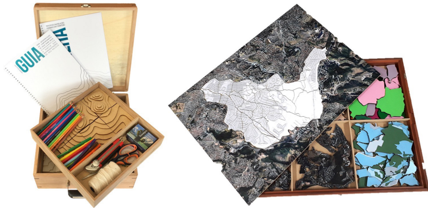
Figure 2: Watershed Delineation Kit and Circumstances Puzzle (The AnC Project Collection).

The second path, somewhat technical, concerns methods of analyzing the circumstances and researching compensatory measures for urban drainage and stormwater management (mainly retention, detention, and infiltration) to feed discussions, decisions, and actions by local groups. To this effect, we began our studies of the Cercadinho watershed by reconstructing the history of its occupation, using as sources the survey of the Cercadinho Farm, recorded on an 1896 map, and an inventory of land development projects between 1970 and 2020. We also compiled a chronology of public works based on the Reports of the Mayors of Belo Horizonte. Furthermore, we analyzed the physical and environmental conditions of the watershed via the interfaces between relief, hydrography, pedology, and urbanization, identifying land use, subdivision patterns, road system, types of paving, networks for water supply, sewage, and electricity, as well as permeability, vegetation and declivities. Based on this data set, we did the circumstantiation described before (Figure 3).