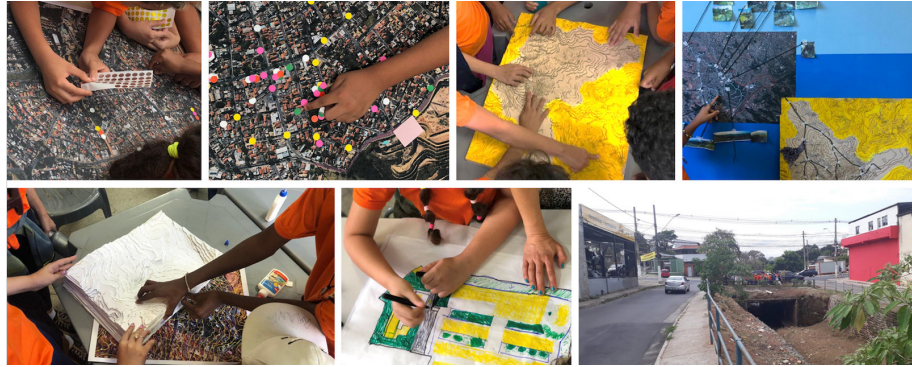
Figure 1: Activities with EMPEV's students: workshops with satellite images, models, maps, and excursions.

cycle; (2) Building non-hierarchical interactions that value and mobilize people's prior knowledge and facilitate their access to formal knowledge; (3) Researching, testing and disseminating diffuse compensatory stormwater management measures; (4) Fostering the collective autonomy of local groups through the production of dialogical-interactive interfaces and tools.